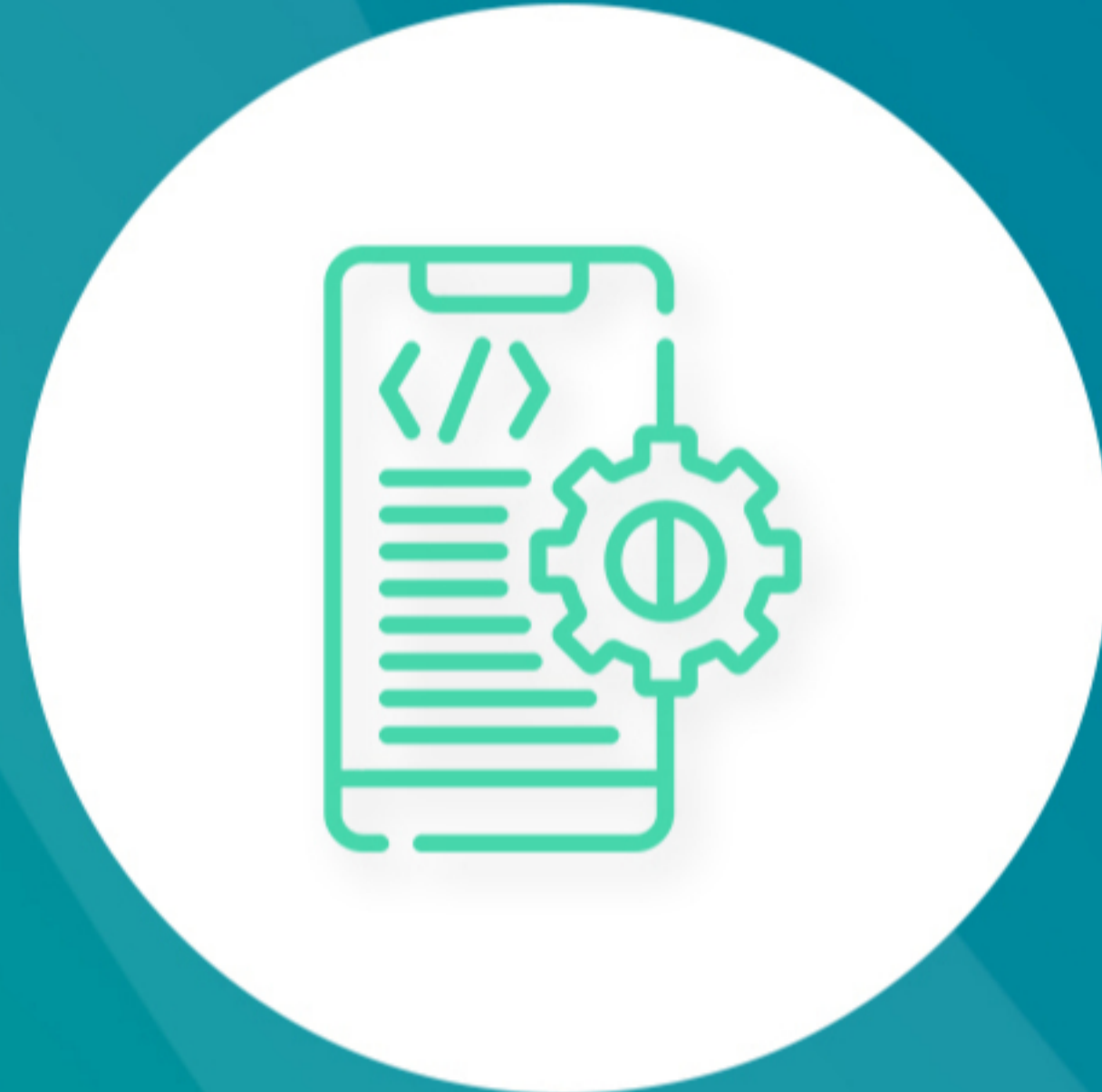
App Development & Management