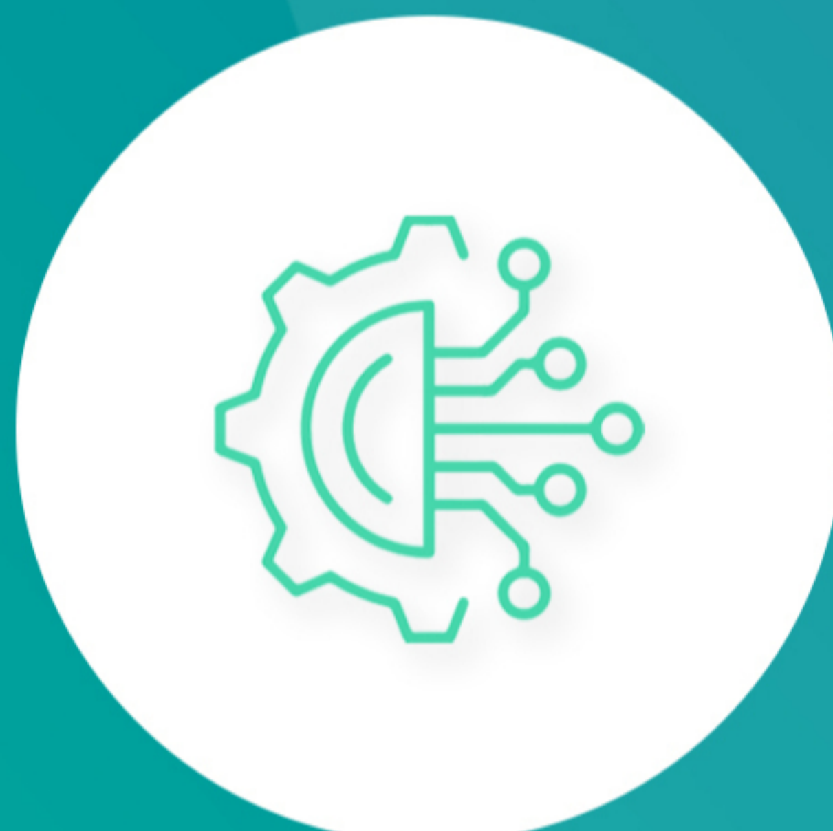
Transformation & Modernization