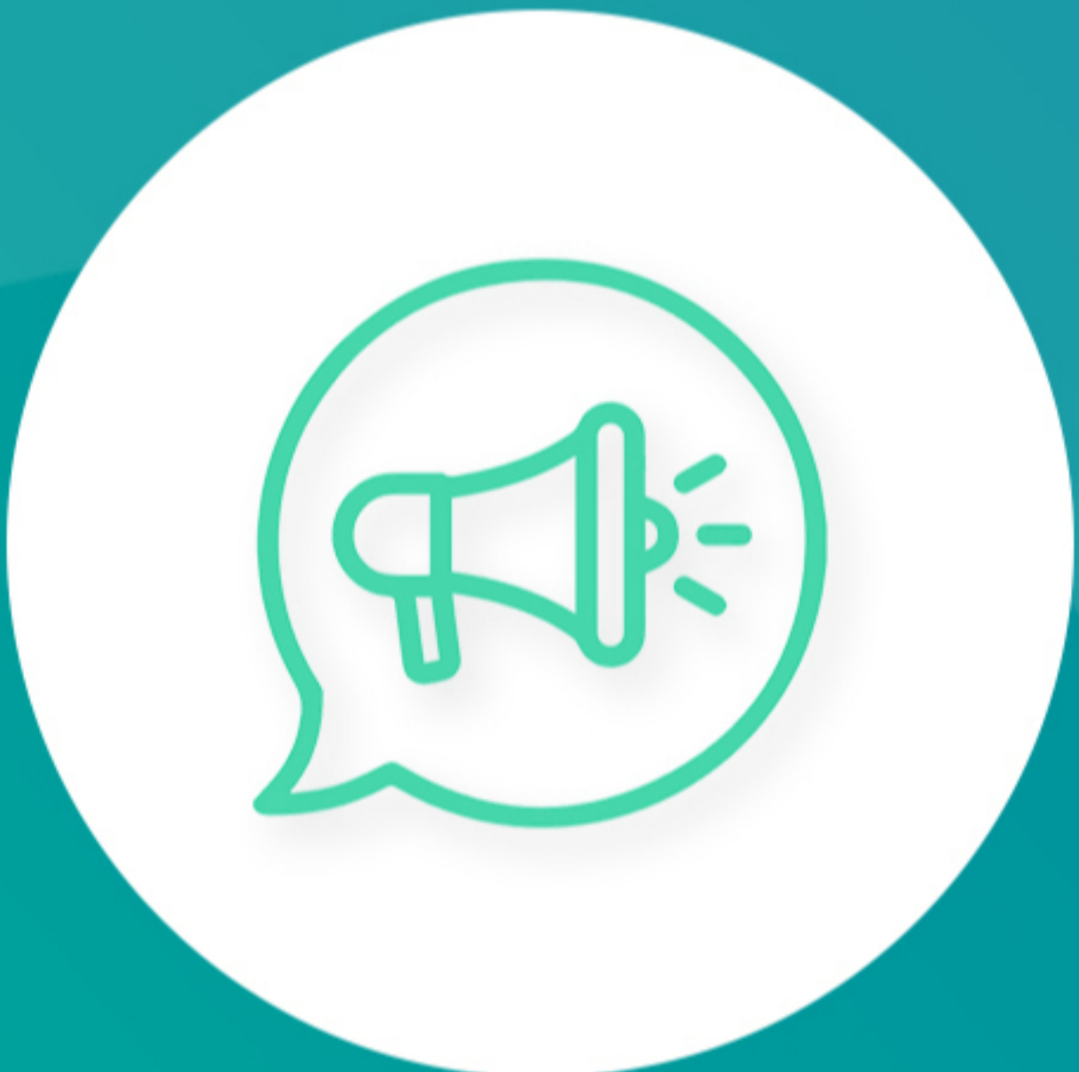
Digital Marketing Personalization