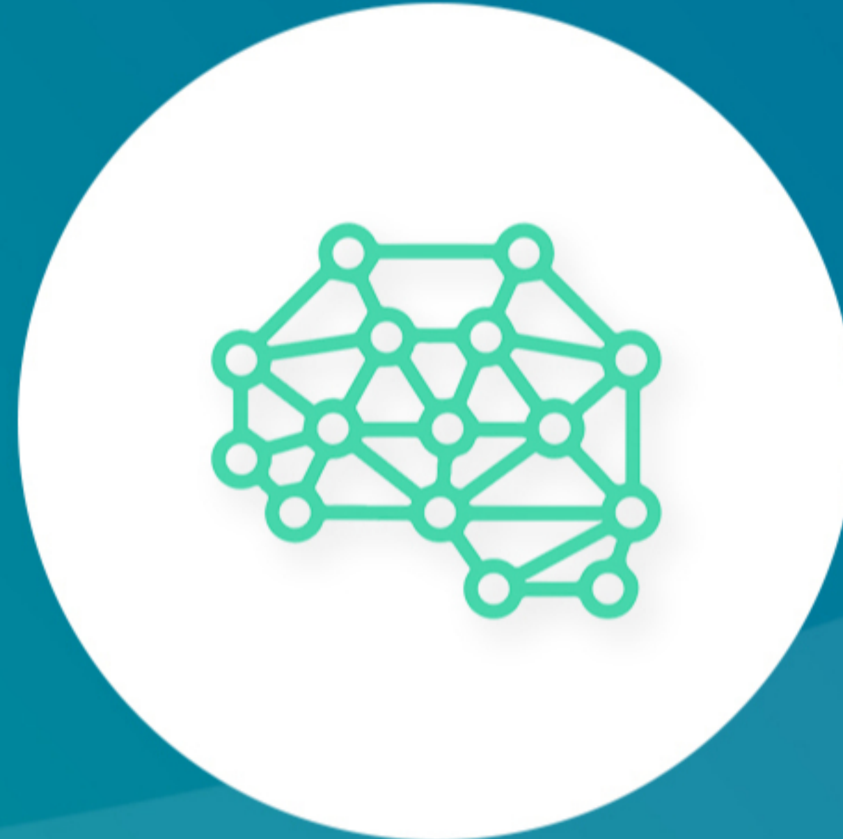
AI, Data & Analytics