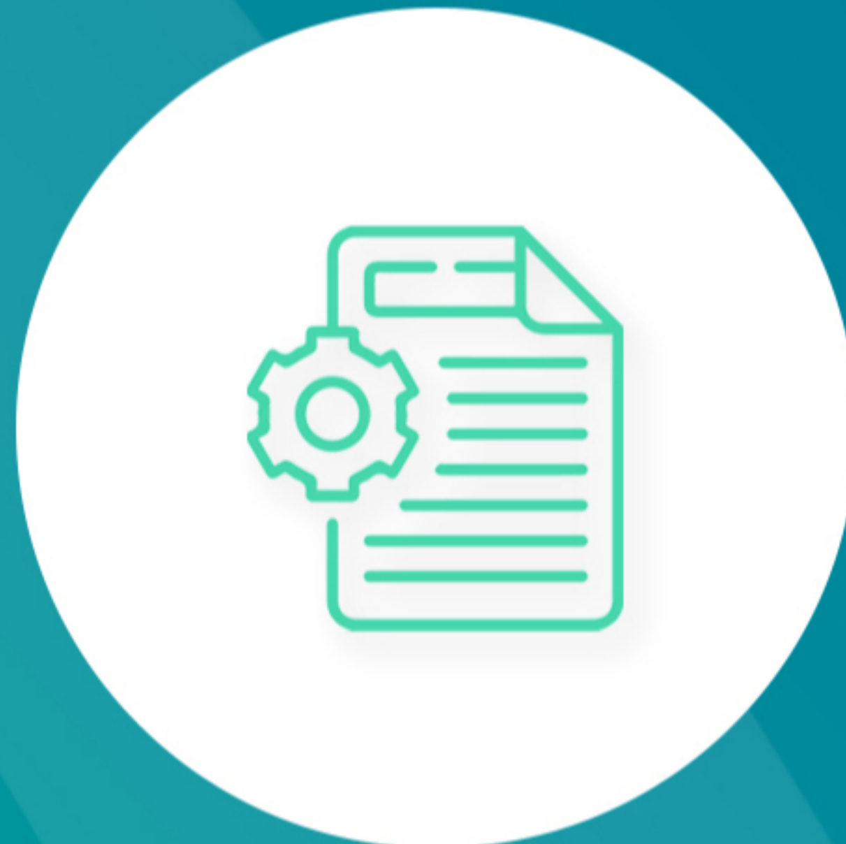
ECM & Portals