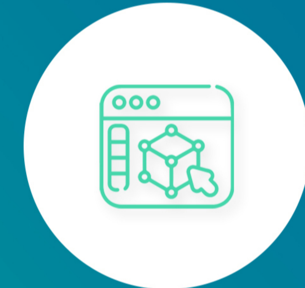
Enterprise Architecture Consulting